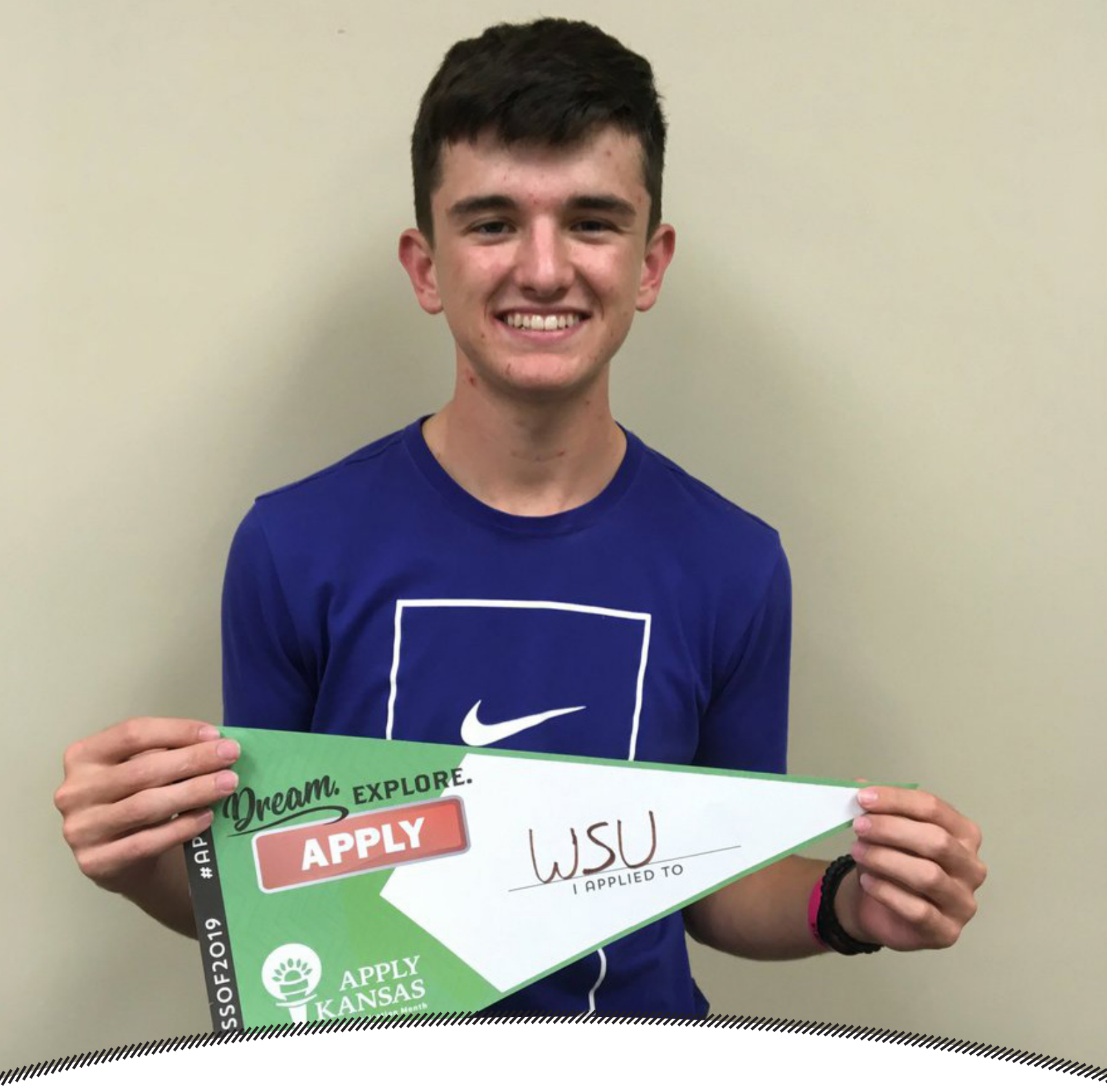
SECTION 3: EVENT PLANNING & AWARENESS ACTIVITES